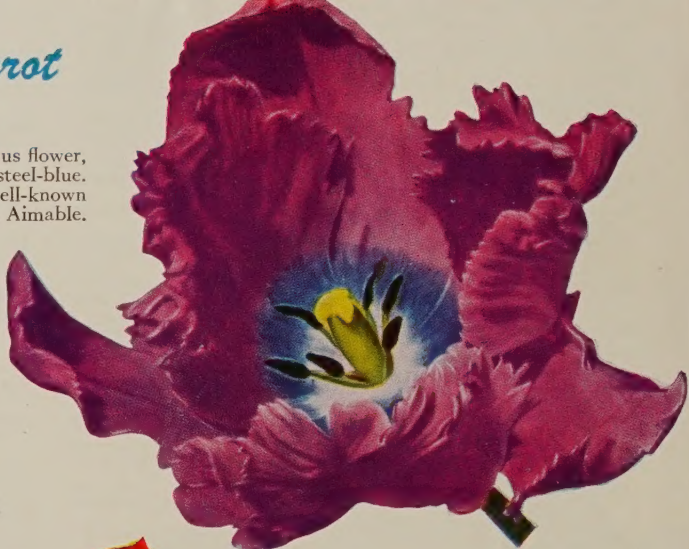
BLUE PARROT TULIP

Blue Parrot. A glorious flower, bright violet shaded steel-blue. A sport from the well-known Darwin Tulip, Bleu Aimable. Very large flower on tall, strong stem. $1.15 per doz.; $9.00 per 100.